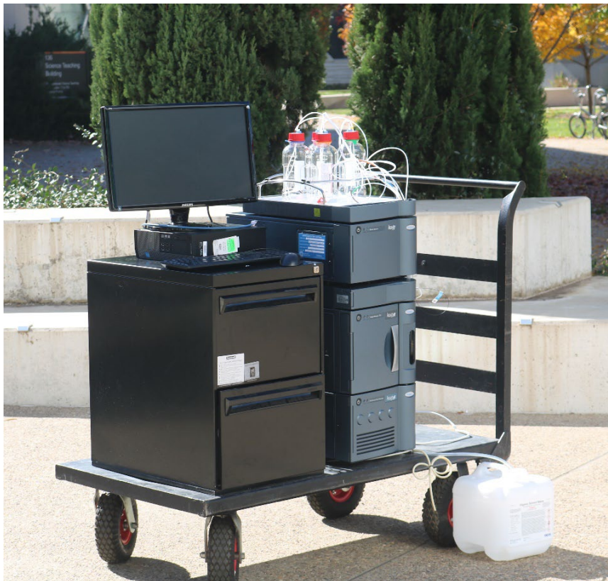
The UPLC-PDA machine installed on a trolley for portability.

HRA is Australia's first national harm reduction organisation for individuals committed to reducing the health, social and economic harms potentially associated with drug use